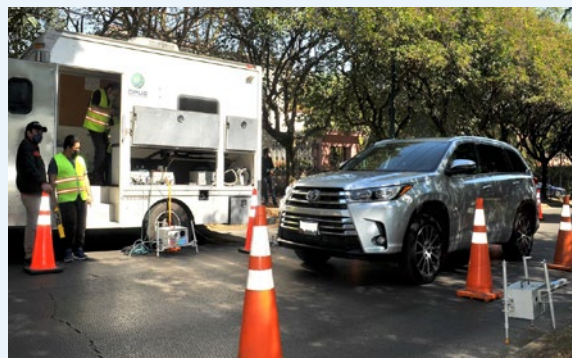
Remote sensing device setup on Blvd. de los Virreyes in Mexico City.

This study was conducted in coordination with the Secretariat of the Environment (Secretaría del Medio